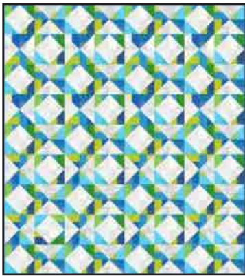
Razzleberry Pre-cuts or Scrappy

A teacher of this quality from the Inland Northwest is not to be missed.