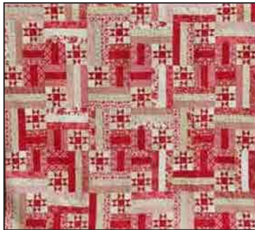
Starberry Pre-cuts or Scrappy